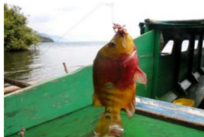
Figure 1. Louhan, the invasive fish species in Lake Matano.

Historically, the introduction of fish has been practiced since Indonesian colonial times, in the 19 century [14], including introduction into inland waters [15]. The number of fish species introduced to Indonesian inland waters was not less than 17 species, mostly as cultured species [15,16], and 16 fish species have been introduced into Sulawesi inland waters. Channa striata , locally known as ikan gabus, was stated as the first introduced species into Indonesian inland waters in 1915, followed by Cyprinus carpio (locally named ikan mas), from China and Japan, in 1920. The introduction of Barbonymus gonionotus (local name tawes) and Trichogaster pectoralis (local name, ikan sepat) in 1937 [24] Tempe Lake, have successfully increase fish production of the lake, and even considered to reach the highest fish catch in the world, producing 980 kg/ha/year [16].